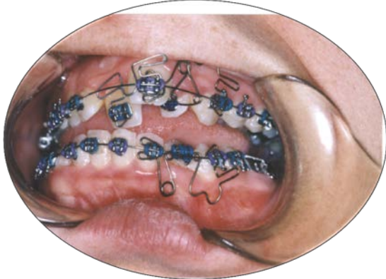
Progress in 2 months and 8 days

THIS WAS DONE WITHOUT STRIPPING ANTERIOR TEETH