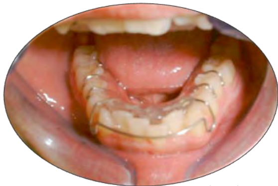
Progress at 3 months and 6 days